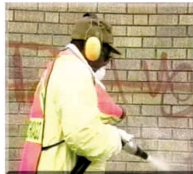
Graffiti and Painted Brick

From painted concrete to soft limestone monuments, SodaBlast Systems™ has no equal.