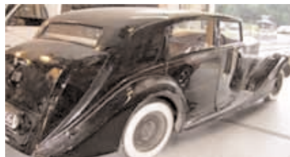
SodaBlast Systems™ is fast, safe and efficient.

Soda blasting effectively removes paint down to the base without damage to metal, glass, plastic or aluminum trim on vehicles. SodaBlasting is ideal for cleaning all types of vehicles.